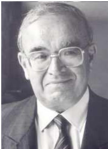
Dr Fereydoon Batmanghelidj

~Dr. Alexis Carrel, Surgeon, Transplant Specialist (1)