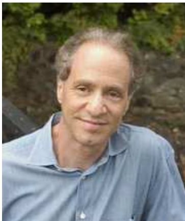
Dr. Ray Kurzweil

"Consuming the right type of water is vital to detoxifying the body's acidic waste products and is one of the most powerful health treatments available." ... "We recommended that you drink 8-10 glasses per day of this alkaline water. It is one of the simplest and most powerful things that you can do to combat a wide range of disease processes. It is interesting to note that in Japan, professional sports teams drink alkaline water to improve their performance" ... "It is well known that many chronic diseases result in excess acidity of the body (metabolic acidosis). We also know that the body tends to become more acidic due to modern dietary habits and lifestyles and the aging process itself. By drinking high negative ORP alkaline water, you combat metabolic acidosis and improve absorption of nutrients."