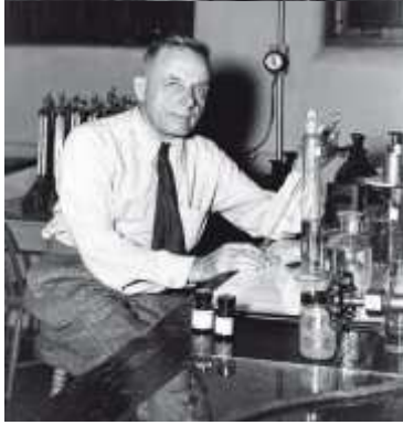
Otto Warburg in his lab at the Max Planck Institute for Cell Physiology in Berlin-Dahlem. 1960s.

"All normal cells have an absolute requirement for oxygen, but cancer cells can live without oxygen - a rule without exception."