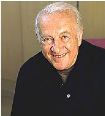
Dr. Robert C. Atkins