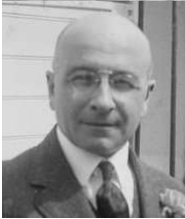
Dr. Alexis Carrel

"The cell is immortal. It is merely the fluid in which it floats that degenerates. Renew this fluid at intervals, give the cells what they require for nutrition, and as far as we know, the pulsation of life may go on for ever."